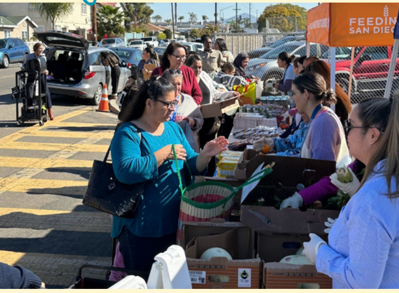
Feeding San Diego