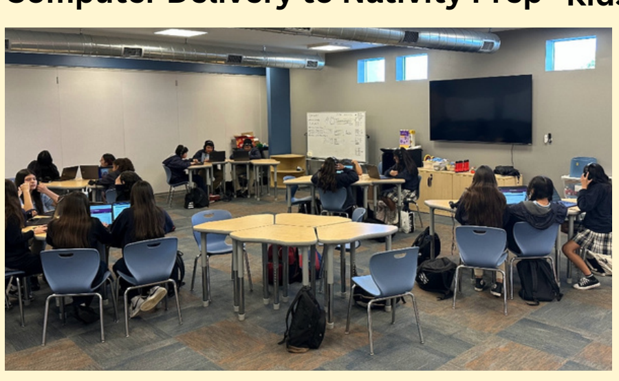
Nativity Prep's New Stem Center