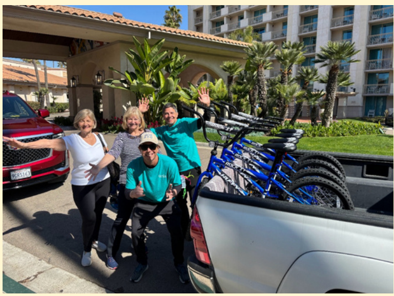
Picking up Bikes