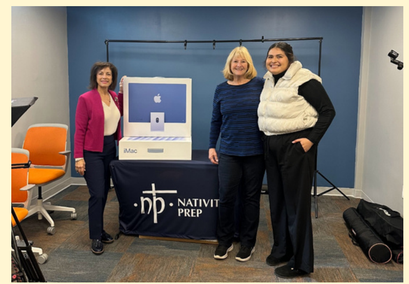
Computer Delivery to Nativity Prep Kids Using Chromebooks-FOCUS Purchase!