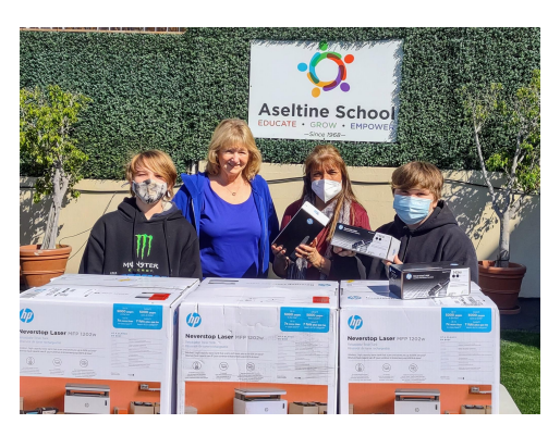
Thank you shoppers!!!