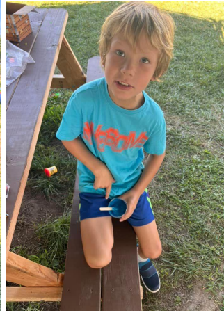
Camp I Can enjoying books, toys and sensory equipment provided by FOCUS