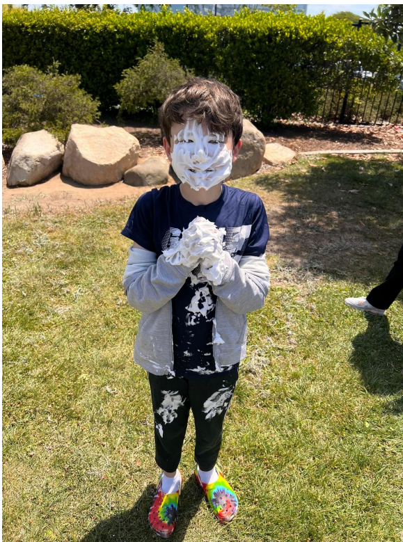
Once again, FOCUS was proud to support the amazing Camp Able in Coronado!!