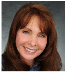
Executive VP, Donato-McConnell